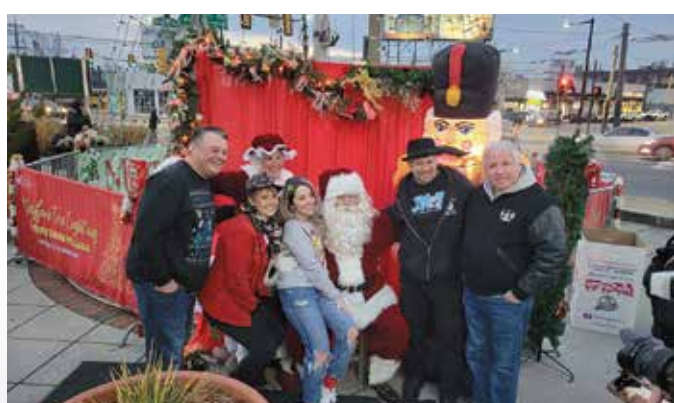
Mayfair Civic Association Tree Lighting 2023 at Cottman and Frankford.